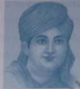
Swami Dayananda Saraswati