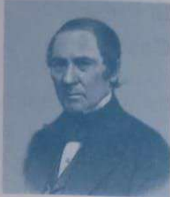
Sir John Macpherson

5. Bankura horses are terracotta horses that were once used more often for religious purposes but now they are used as decorative items. It is very stylised figure with a long neck and elongated ears, in warm terracotta colours. With which state is this Bankura horse associated?