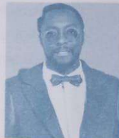
will. i. am